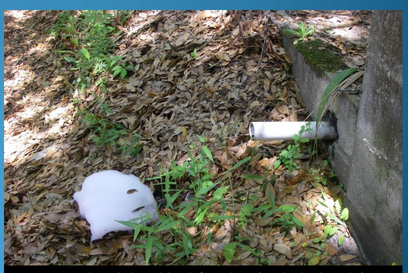
Detergent being discharged directly from a home (note bright white color)