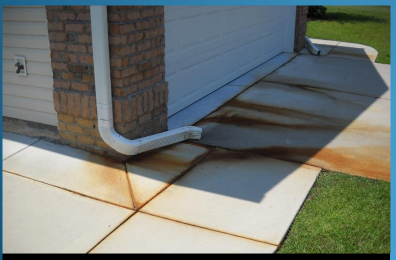
Iron stains from groundwater seepage